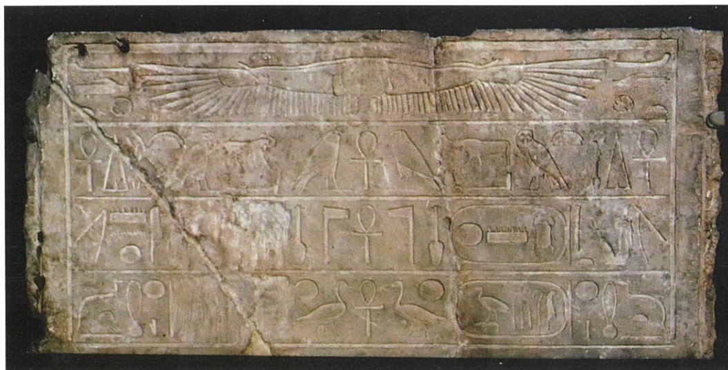
Hieroglyphs are inscribed into a limestone lintel partially defaced with the cartouches of (probably) Hatshepsut scraped out. It was discovered in the Ramesseum, reused in the 9th century BC. But it originally was part of Hatshepsut’s temple. It is now in the University of Pennsylvania Museum. This carving was exhibited in “Egypt Gift of the Nile” in Seattle from October 1998–January 1999.

Both the Thutmosid and Ramessid periods in Egypt saw vast construction near Tell el-Dab’a in the Nile delta. While construction during the time of Rameses II is well attested, there is now also good reason to view the period of the 18th Dynasty as one of large-scale construction in the delta. The biblical text testifies to Pharaoh building up the “storage cities” of Pithom and Rameses (Ex 1:11). If we allow for a later updating of the site name to match the contemporary 19th Dynasty usage under Rameses II, the earlier name associate with the site would be the harbor city of Peru-nefer. 18 The usage of the Hebrew term for storage cities agrees with recent archaeological analysis of the area around Tell el-Dab’a as a naval base of foreign campaigns for the 18th Dynasty.