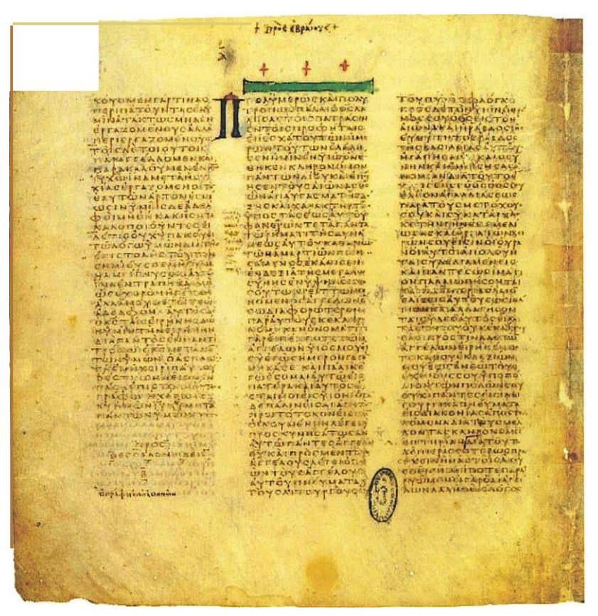
The Codex Vaticanus originally contained a complete copy of the Septuagint (LXX) and has been stored at the Vatican Library since the library was founded by Pope Nicholas V in 1448. Some scholars have argued that Codex Vaticanus was among the 50 Bibles that were produced by Eusebius of Caesarea under orders from Emperor Constantine I in AD 322.

In Judges 11:16, Jephthah recounts to the Ammonites that Israel journeyed through the wilderness unto the yam suph, and came to Kadesh at the border of Edom. His reference is to the history of Numbers 21:4, where Israel journeyed from Mt. Hor by "the way of the yam suph" in order to go around Edom. "The way of the yam suph" is arguably a way they had been in ever since crossing the yam suph 40 years earlier: thus we have the Alexandrinus "Red Sea" reading for Judges 11:16, since the LXX always uses "Red Sea" in reference to the miraculous crossing. Numbers 21:4 was thus Jephthah's reference. Jephthah's own construction, however, places the yam suph after the wilderness wanderings, so his yam suph is presumably at the northern tip of the Gulf of Agaba, at the border of Edom; he makes no apparent reference to the yam suph/Red Sea crossing. Thus, we have the Vaticanus "Siph Sea" reading for Judges 11:16, to set this